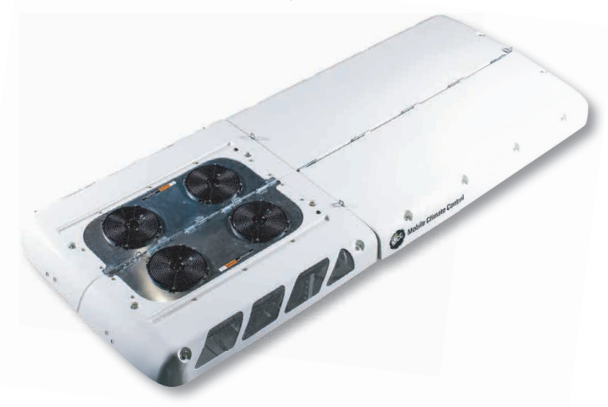
Eco 353 Narrow

The system uses MCC's micro-channel heat exchanger (MCHX) coil technology, which delivers significant performance improvements through better heat transfer and thermal performance. Extended motor life is available through the use of brushless motors.